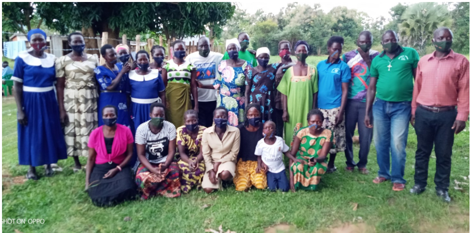
People of Kajo-Keji proud to wear the face masks made by MU.

In the summer, 75 MU members joined forces, and worked on vegetable growing. They also continue mask making (distributed to the community) and dignity kits for girls.