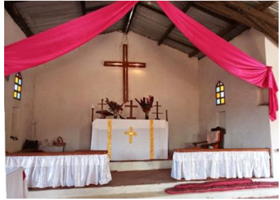
The New Church

In 2018 a second visit was made. This time we led two 3 day courses for women, to encourage them to initiate or support projects related to health care and family planning. They showed a willingness to work together