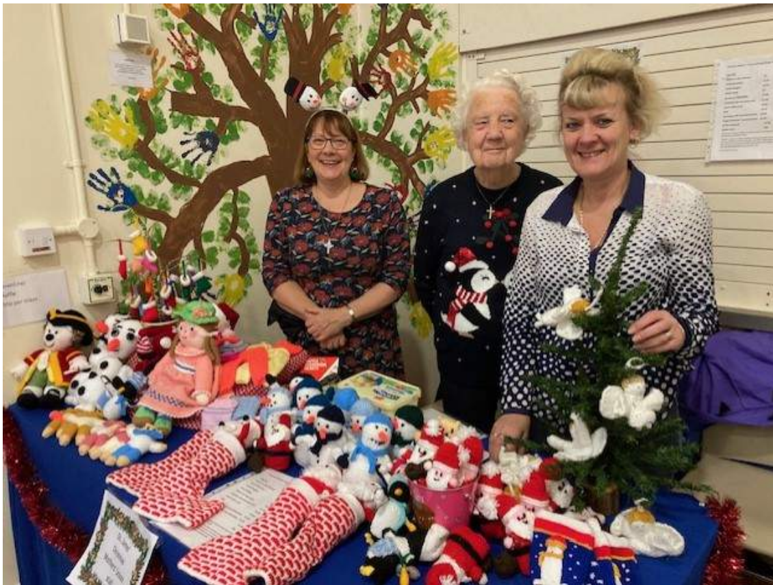
Here is a lovely photo of Knit and Natter members from St. James', Hill MU at our Christmas Fair in November. They always have a stall to raise funds to purchase more wool to continue knitting for the MU projects they support.