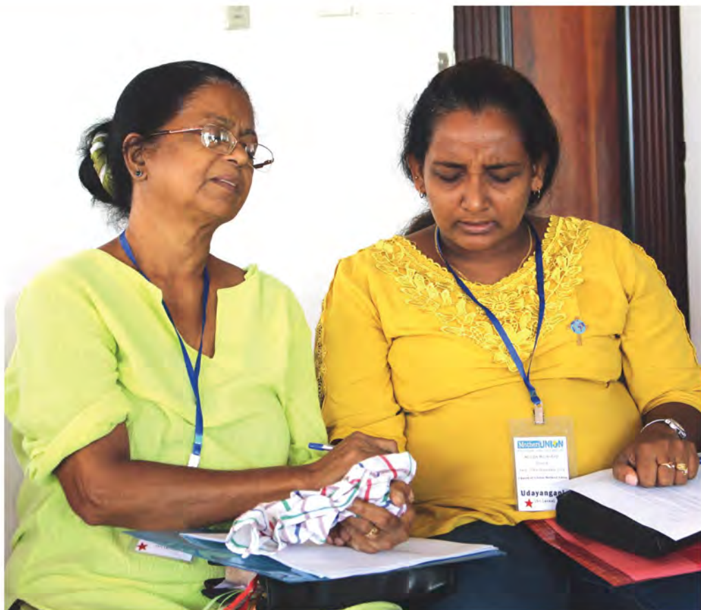
Members from Sri Lanka and India praying at MULOA workshop