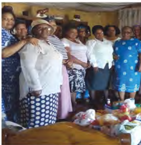
Members delivering groceries

L istening has played a crucial role and had a major impact amongst members in our zone since the inception of MULOA. Members have learned to listen carefully to others and act according to what they have heard. Mothers' Union is now able to mobilise relevant government structures as well as NGOs to intervene and help the communities in need. Communities are also encouraged to use their skills as well as their available resources to sustain themselves.