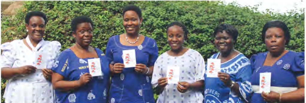
Ugandan MU coordinators holding the 2020 Make a Mother's Day seeded cards

rather than just individuals. Mothers' Union is reaching out to children and youths through schools, giving talks on hygiene and relationships. They are also counselling parents in the community, especially on issues such as early child marriage.