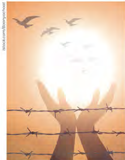
Giving hope to prisoners in the Diocese of Durham

M ULOAs have had a really positive effect on rejuvenating the members in this zone and has enabled the continuance and even reopening of some branches in the Province of York. However, our biggest challenge continues to be a decreasing membership and we only have a small number of “active” members in the zone.