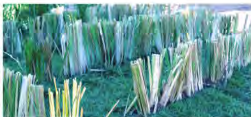
Vetiver – a fast growing grass which preserves the soil during the rainy season

The biggest challenge in our zone is social injustice and so tackling this is our priority for 2020.